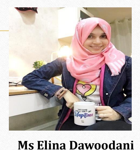
Wadia Currently pursuing PH.D in Purdue University, USA on full scholarship