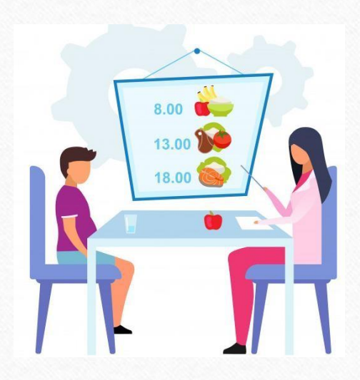
Nutritionist / Dietitian