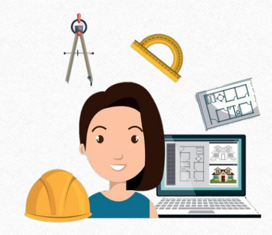
Interior Designer and Consultant