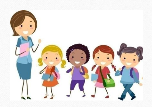
Optimizing Human potential